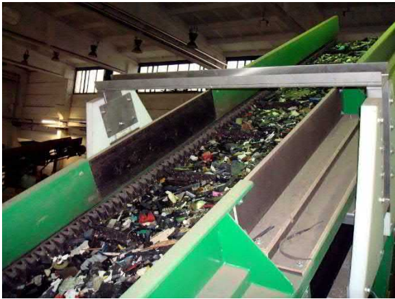
Metal detector PSQ RA in the recycling industry.